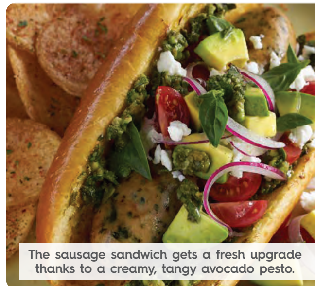
The sausage sandwich gets a fresh upgrade thanks to a creamy, tangy avocado pesto.