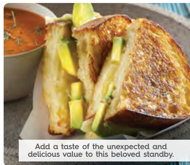
Add a taste of the unexpected and delicious value to this beloved standby.