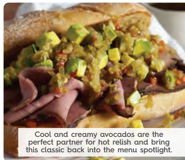
Cool and creamy avocados are the perfect partner for hot relish and bring this classic back into the menu spotlight.