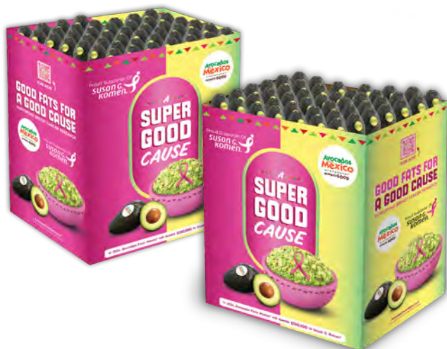
SGK MEDIUM BIN 25"L x 17"W x 30"H